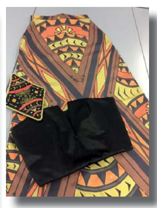
Year 12 Construction students are putting their practical skills into

practice. This week they formed up and completed a concrete ramp at the eastern end of the Industrial Arts block. This will improve access for material deliveries and provide a 'real life' learning experience for the students.