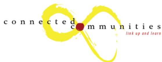
Erica Burge Principal

https://education.nsw.gov.au/public-schools/connected-communities/connected-communities-strategy